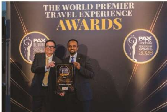
Ethiopian Airlines Wins Three Prestigious Titles at the 2026 PAX Readership Awards