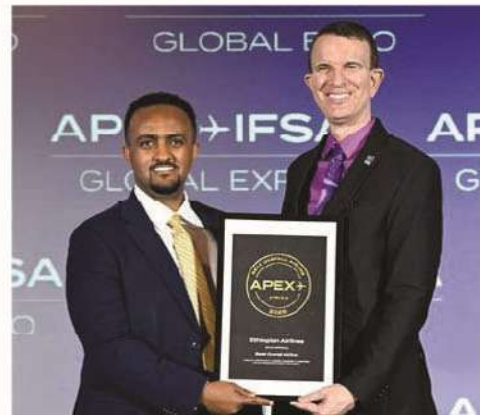
Ethiopian Airlines is pleased to announce its recognition as the winner of the 'Best Overall in Africa' at the prestigious 2025 APEX Passenger Choice Awards