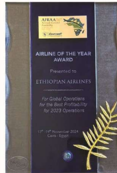
Ethiopian Airlines has been awarded "Airline of the Year - Global Operations" award at the AFRAA 56th Annual General Assembly in Cairo.