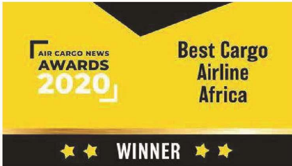
'Best Cargo Airline – Africa' Award at the Air Cargo News Awards 2020