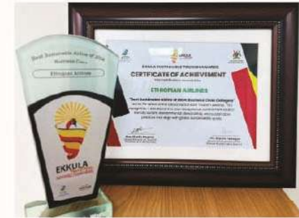
Ethiopian Airlines has been honored with the prestigious "Best Sustainable Airline of 2024-Business Class Category" award at the "Ekkula Tourism Awards 2024" in Uganda