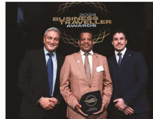
Ethiopian Airlines has been named the 'Best African Airline' at the Business Traveler Awards 2024!