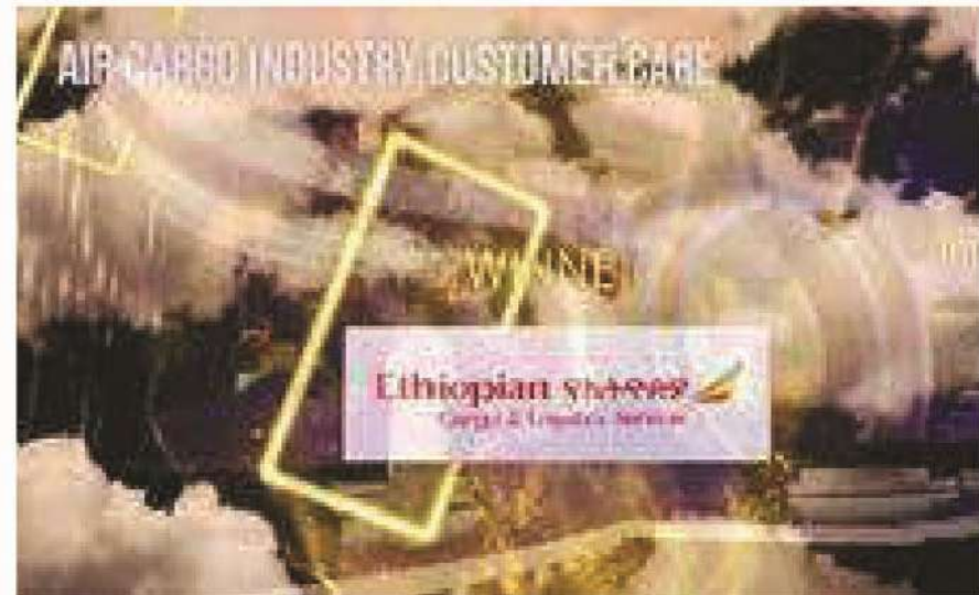
Air cargo Industry customer care Award 2021 and 2022