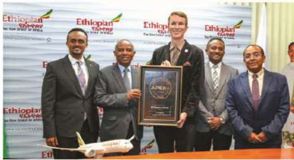
Ethiopian Airlines has received the 2026 APEX Best Airline in Africa Award.