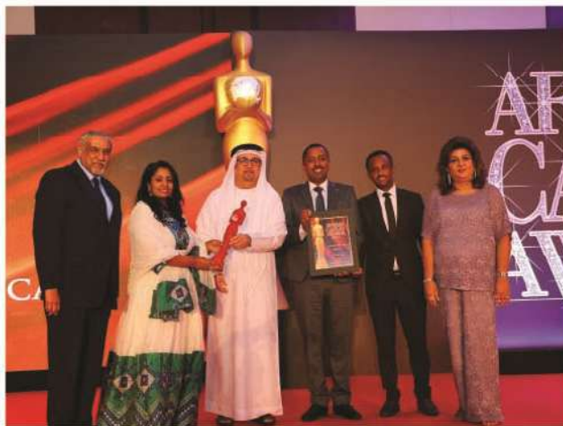
Ethiopian Cargo and Logistics Service has been honored with the "Best Cargo Airline-Africa" award for the second consecutive year at the Arabian Cargo Awards, in a ceremony held in Dubai, UAE.