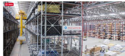
Unitechnik planned and realized the new air cargo terminal for the national airline Ethiopian Airlines

Tewolde GebreMariam, CEO of Ethiopian Airlines , says the airline's new 38,000sqm air cargo terminal in Addis Ababa puts the city in direct competition with hubs like Dubai