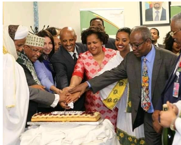
Ethiopian in pictures