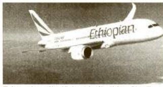
The fastest growing post-African airline is connecting Africa with the rest of the world. flow exceed 200,000 passengers to five hubs and has a share of around 20 % of India-Africa air traffic, second only to Emirates. It then flights to four Indian cities and

All persons on Indian carrier flies to Africa and passengers to the continent fly via Addis Ababa, Dubai, Nairobi in other hubs. Between January-December 2016 Ethiopian Airlines