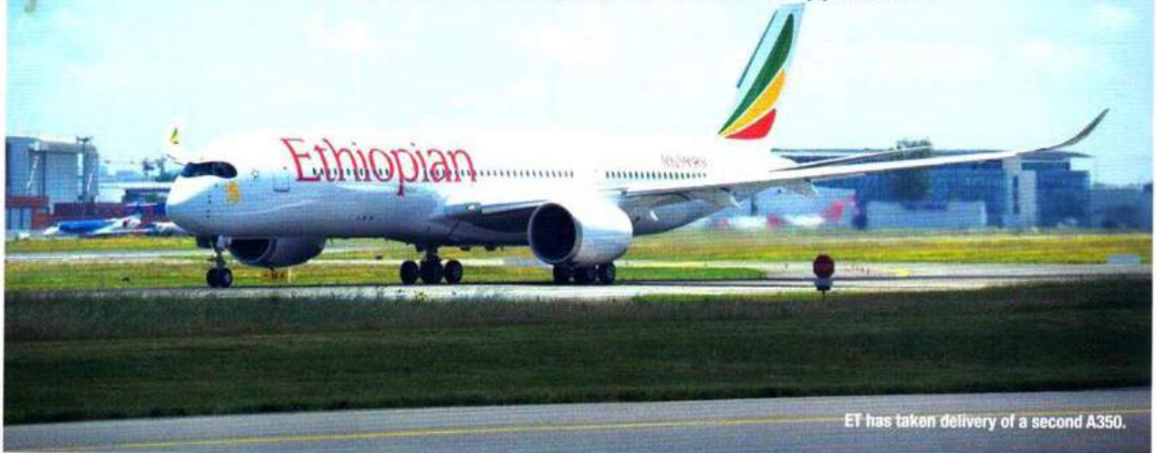
ET has taken delivery of a second A350.